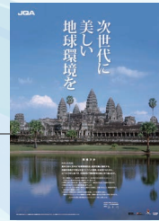
JQA Environmental Policy Poster

In 2007, we inaugurated the "JQA Forest" in Takayama-city, Gifu Prefecture in Japan. Through activities of preservation and cultivation of the forest, we are striving to conserve nature for the future.