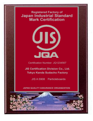
Mt. Fuji and Cherry blossom

Standard version (Red) with metal (Aluminum) plate