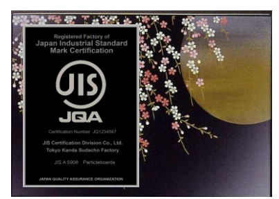
Weeping cherry and the big moon