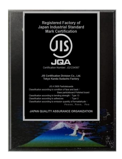
Mt. Fuji and Cranes