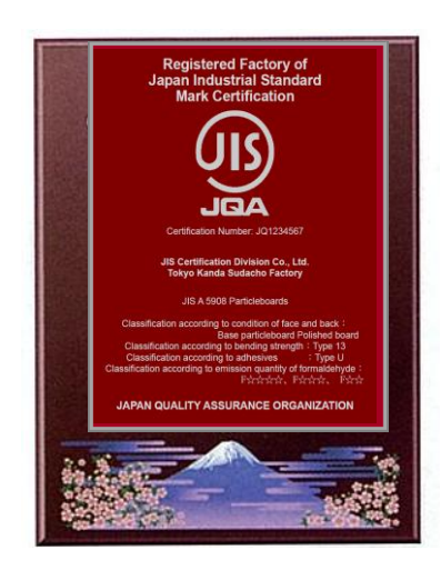
Mt. Fuji and Cherry blossom